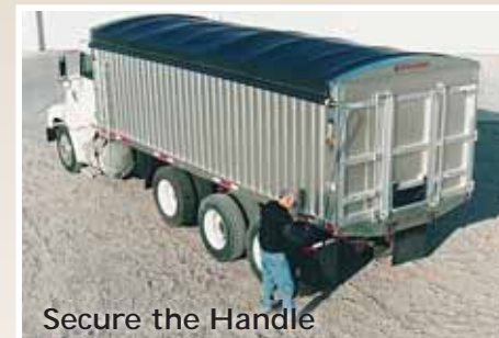
Secure the Handle

Tarp takes only seconds to operate from the ground with no tie-downs. It remains secure during entire rolling operation, even in windy conditions.