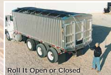
Roll It Open or Closed

Tarp stores neatly out of the way when open. It allows you to fill from either side reducing risk of tarp damage from loaders.